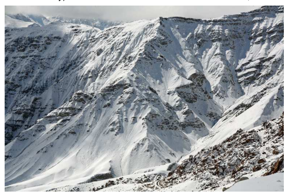
Sun 17 Feb Another morning spent looking for snow leopards and other wildlife. Drive back to Leh in the afternoon. (All meals are included today) O/n GRAND DRAGON HOTEL, FB.

seen. Higher in the mountains, lammergiers and golden eagles can be seen along with the Tibetan and Himalayan snowcocks. (All meals are included today) O/n SNOW LEOPARD LODGE HOMESTAY, FB.